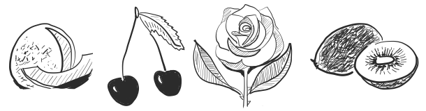
Melon White Cherry Rose Hip kiwi